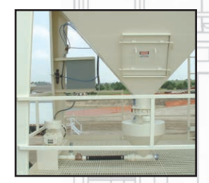
Automatic Recycle System

Turn-Key Installations Customized Layouts Start-up and Maintenance Training Professional Consultation